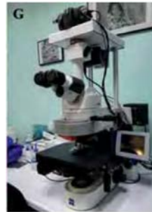
Multispectral microscope 2